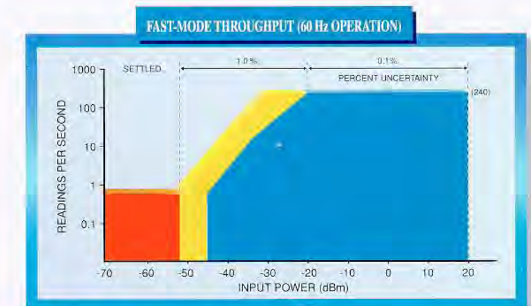
High-speed readings offer a new level of precision testing. With advanced digital signal processing and fast-response sensors, Boonton's 4230A and 5230 series provide > 200 readings per second over a 90-dB dynamic range for fast, accurate testing and increased manufacturing throughput.

Speed, accuracy, ease of use make the 5230 series the most exciting new RF power measurement system available...and your best investment for the future.